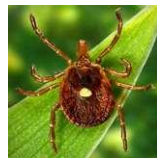
A. americanum Female lone star tick. Males lack the white dot in the middle.

Ticks may carry other diseases: Ehrlichia, Rocky Mountain Spotted Fever, Babesia, Anaplasma, Mycoplasma, Bartonella, etc. If you contract a co-infection, diagnosis and treatment may be more complicated.